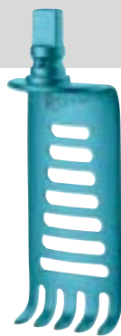
medial blades (large teeth)